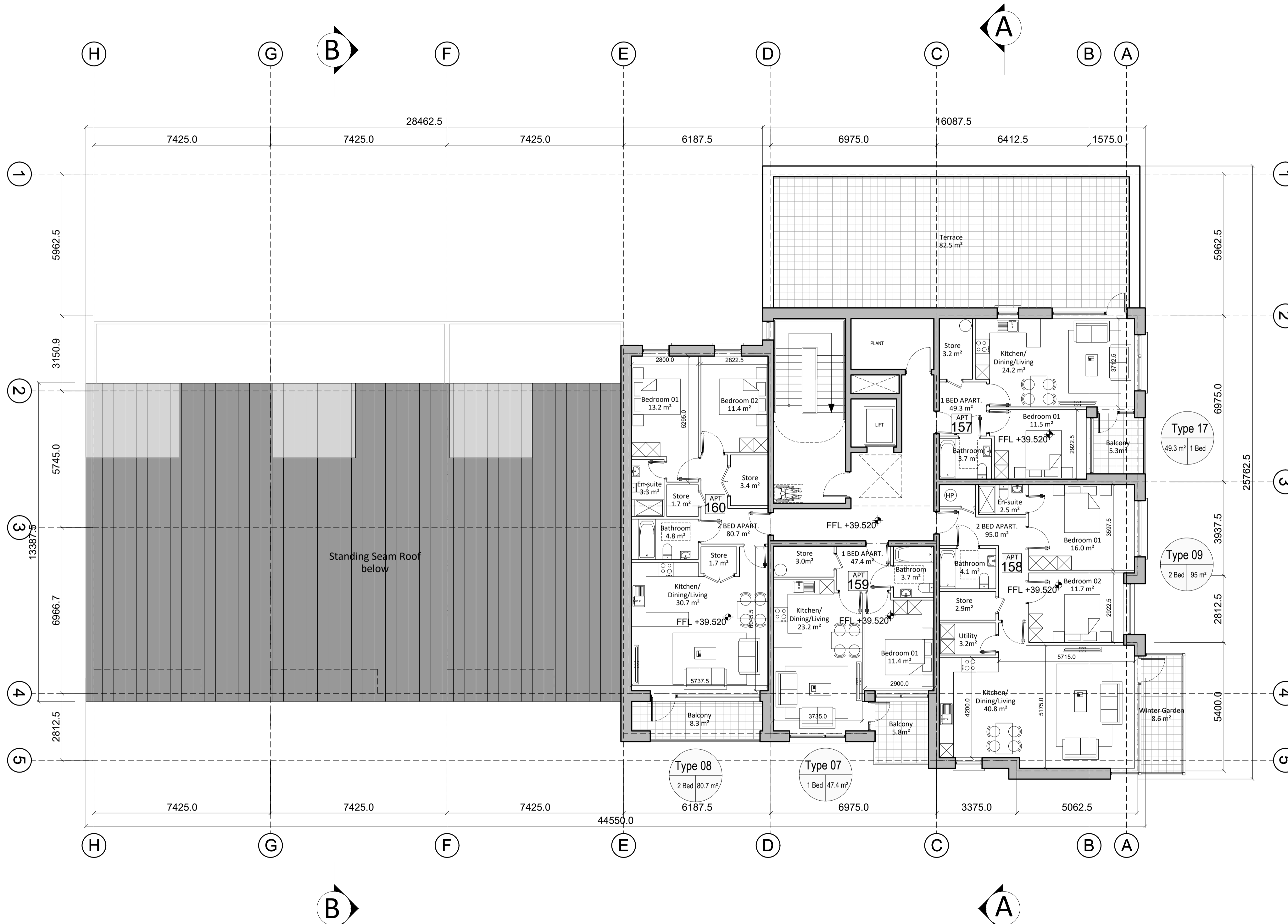
Fourth Floor Plan

NOTE: Do not scale from this drawing, written dimensions only to be used. This drawing is for planning purposes only & not for construction. Levels shown are for information purposes only & may not relate to O.S. Malin Head Datum. For actual O.S. Malin Head Datum always refer to the Site Layout Plan. DDA Architects Ltd. retain copyright and ownership of this design which is not transferable.